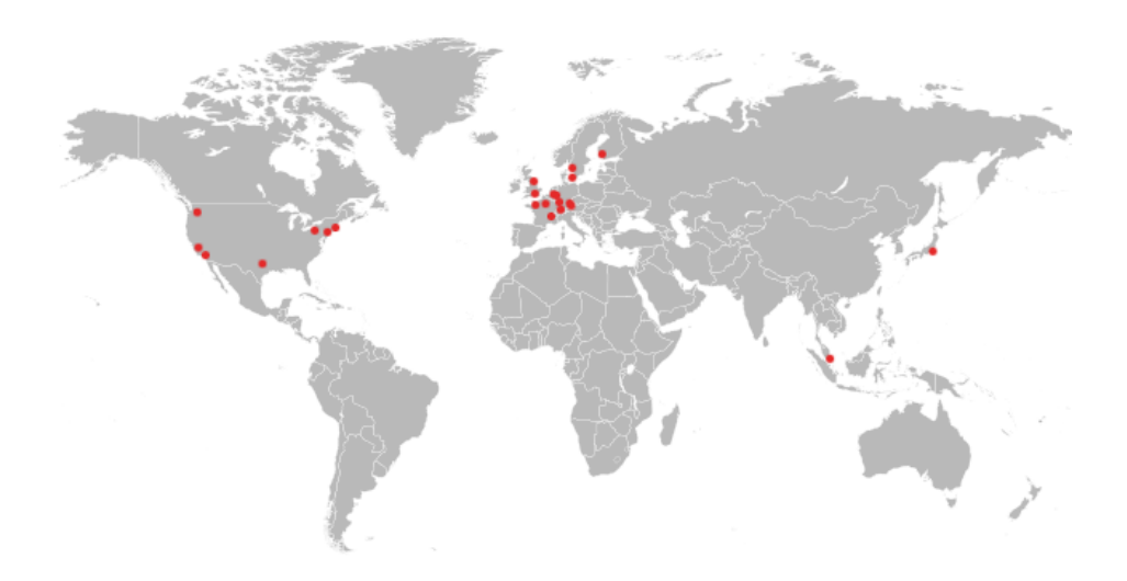
Fig. 1. Geographical distribution of the participants.

The 2nd Verified Software Competition: Experience Report